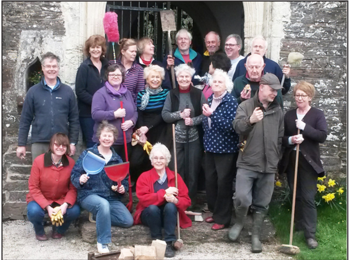
A team of clean-up volunteers getting stuck in last month

What do you want from St Andrew's? The church is badly in need of TLC! And it should be offering more to you and our whole community. If we work together to decide what it can do for us then we are much more likely to be able to raise the money needed to keep it in decent repair and suitable for everyone's use everyday.