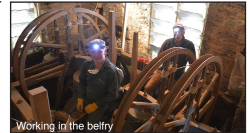
Working in the belfry

More money in the pot. We have run two more terrific events this year and boosted the fundraising coffers from them and donations from other events by a total of £1,718. A concert in the church of three of Bach's Cello Suites was sublime – the playing, the setting and the sense of peace and community it created (and it raised just over £1,000 after expenses). The Craft Fair donated £603, the quiz for the Harberton Community Land Trust donated £30 and the pub pot raised a further £22. We now have £10,200 in the bank to put towards urgent repairs.