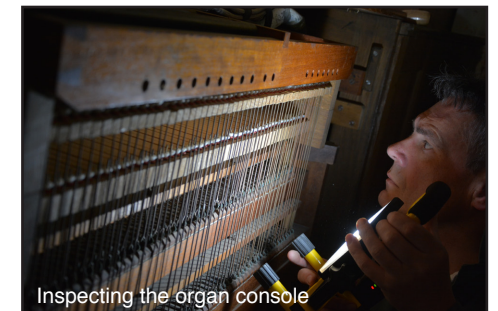
Inspecting the organ console

Hope for our organ. We are continuing investigations and assessments of just how much we need to do in the church, and what it will cost. Recently, engineers from the company that made it in 1858 surveyed our fine 'Father Willis' organ. We await their full report, and there were reasons to be a little encouraged. Maybe we'll find our lost chord after all!