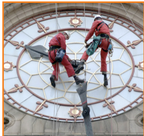
The photo shows the Cumbria Clock Company at work on the clock face at Manchester Town Hall.

Harberton's church clock underwent a major overhaul in the workshops of the Cumbria Clock Company in Penrith. Since its reinstallation there have been problems with the external clock hands. Recent high winds may have made the situation worse. Cumbria Clock Company believe the problem lies with the hands & dial motion works [the gears behind each dial] which may require a workshop overhaul and removal of the hands using roped access. In the meantime, we hope to keep the clock striking the quarters and hours.