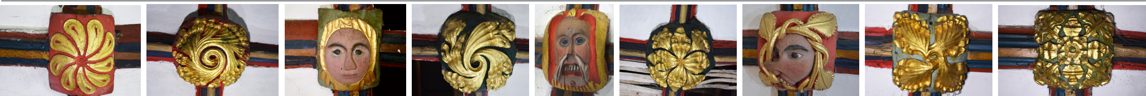
Some of St Andrew's fine medieval ceiling bosses