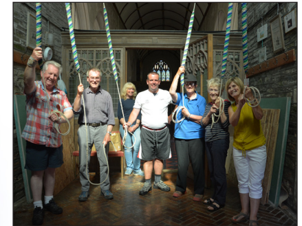
A visiting bell team